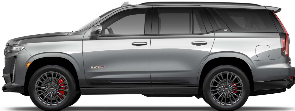
ARGENT SILVER METALLIC 1