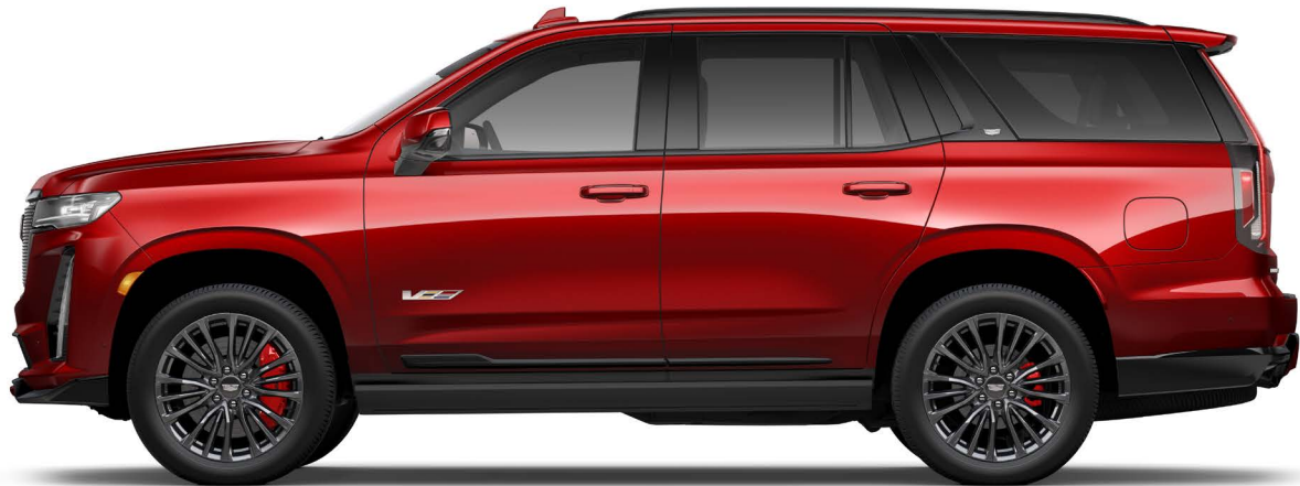
RADIANT RED TINTCOAT 1