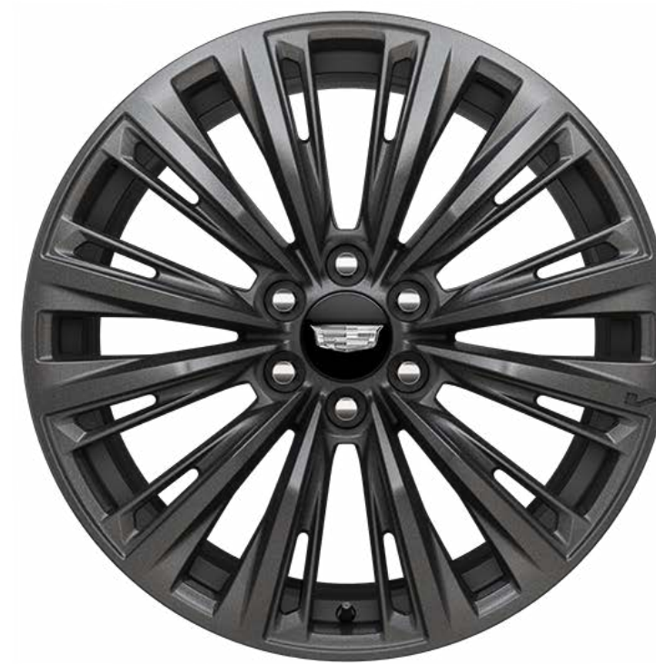
AVAILABLE 22" FORGED MULTI-SPOKE ALLOY WITH SATIN GRAPHITE FINISH AND LASER ETCHING 1