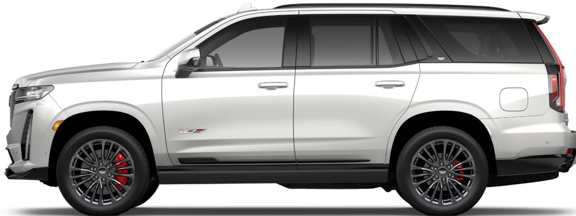
CRYSTAL WHITE TRICOAT 1