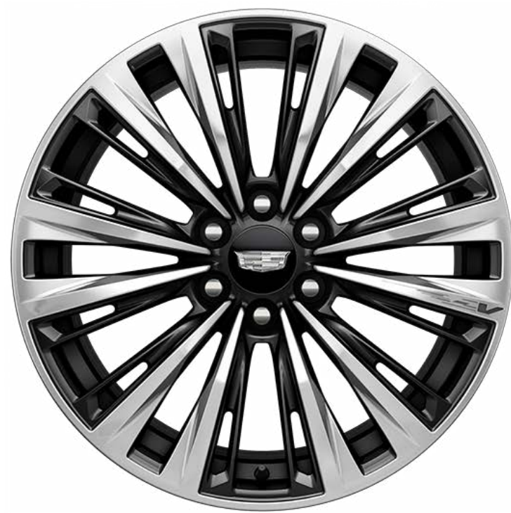
AVAILABLE 22" FORGED MULTI-SPOKE POLISHED ALLOY WITH DARK ANDROID FINISH AND LASER ETCHING 1