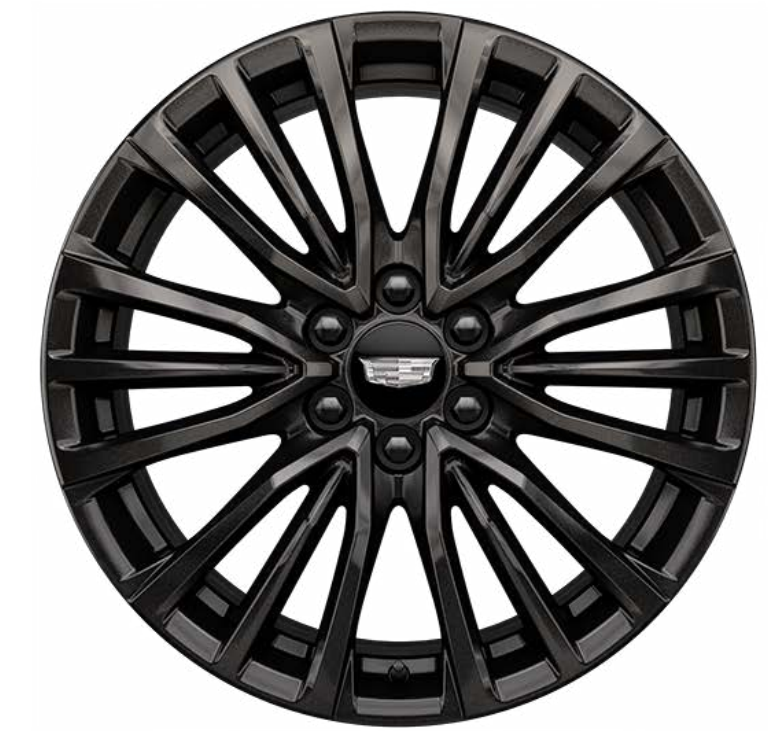
STANDARD 22" 18-SPOKE ALLOY WITH AFTER MIDNIGHT FINISH AND LASER ETCHING