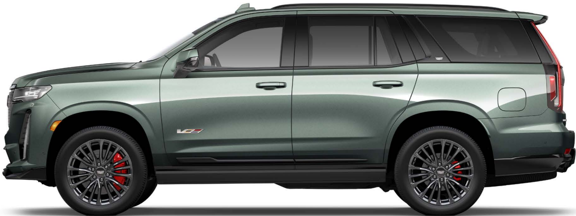
DARK EMERALD METALLIC 1