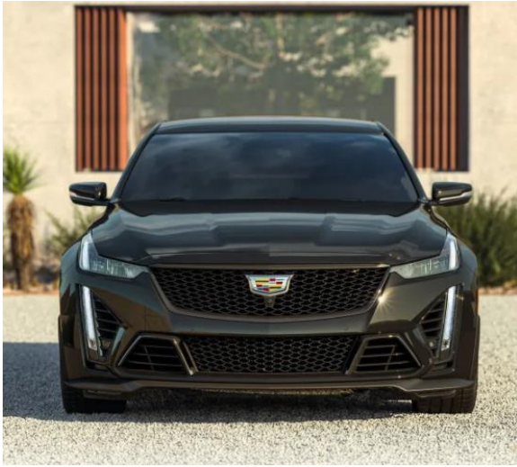
GBA – Black Raven