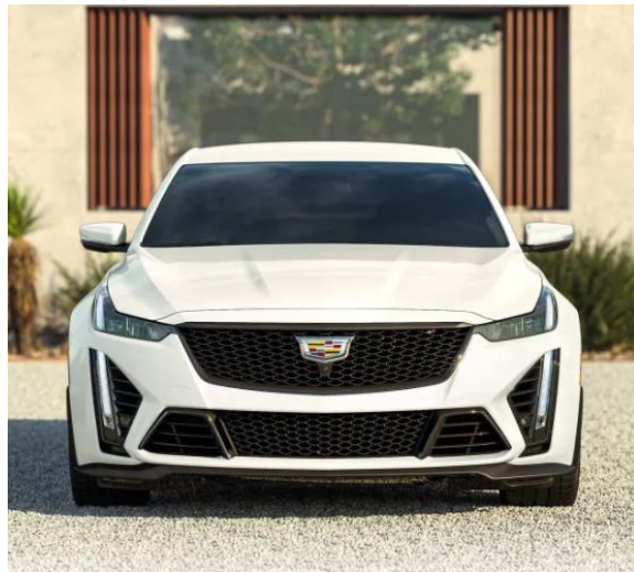
GAZ – Summit White