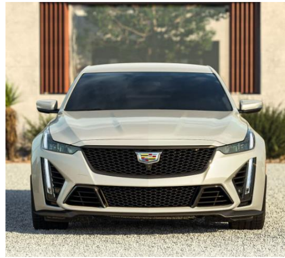
GRW – Rift Metallic 1