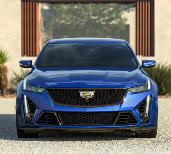
GKK – Wave Metallic 1