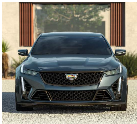
GJI – Shadow Metallic 1