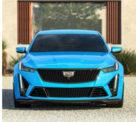
GMO – Electric Blue 1

1 – Available at extra charge. 2 – Available at extra charge. Late and limited availability. Not available to initial reservation and early regular production vehicles.