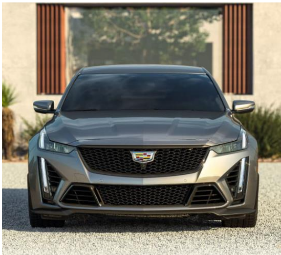
G9K – Satin Steel Metallic 1