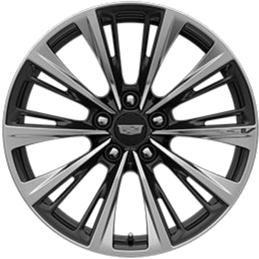
Q63 – 19" alloy with Polished / Dark Android finish