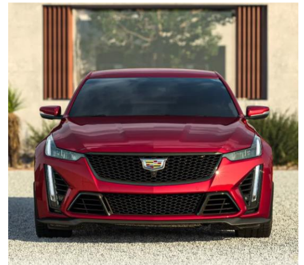
GSK – Infrared Tintcoat 1