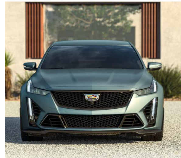
G7W – Dark Emerald Matte 2