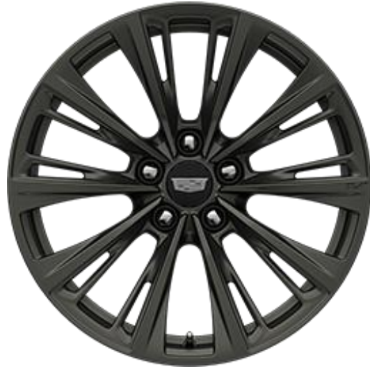
Q61 – 19" alloy with Satin Graphite finish