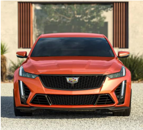
GCF – Blaze Orange Metallic 1