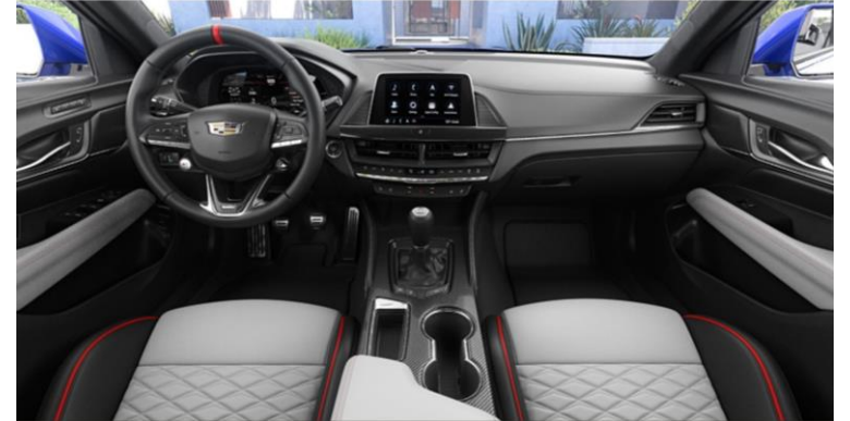
HEB - Sky Cool Gray/Jet Black interior; high-performance front seats and steering wheel; leather seating surfaces with perforated, faceted quilting; leather-trimmed armrests; carbon-fiber-trimmed steering wheel and console; and sueded-microfiber accents on headliner, doors and front seatbacks.