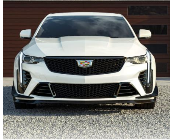
GAZ – Summit White