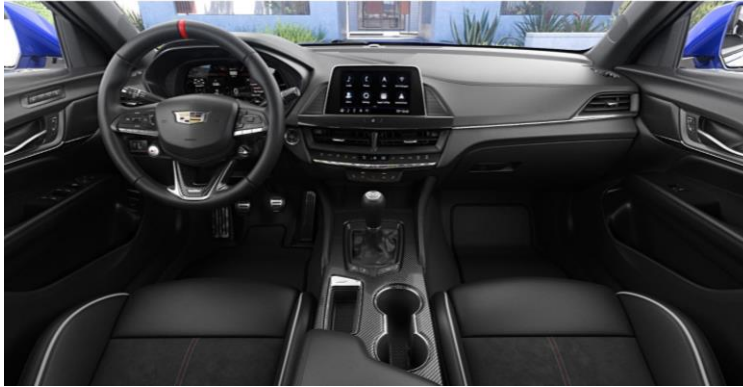
HBE – Jet Black interior; high-performance front seats and steering wheel; sueded-microfiber and leather seating surfaces; carbon-fiber-trimmed steering wheel and console; and sueded-microfiber accents on front seatbacks.