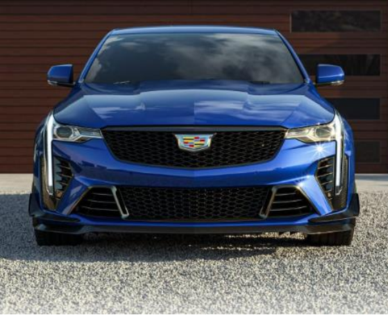
GKK – Wave Metallic 1