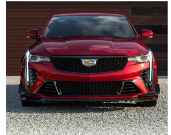
GSK – Infrared Tintcoat 1