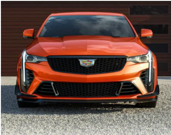
GCF – Blaze Orange Metallic 1