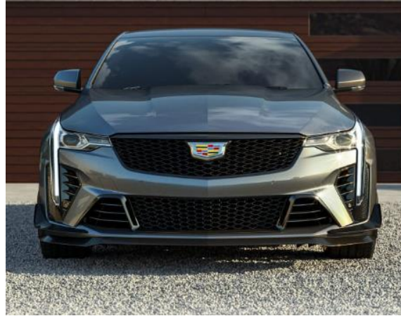
G9K – Satin Steel Metallic 1