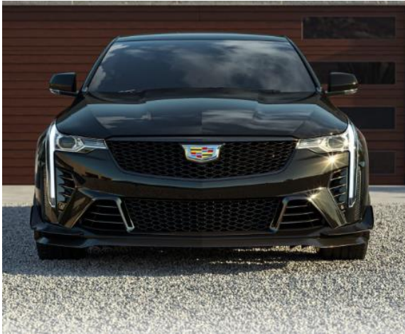
GBA – Black Raven