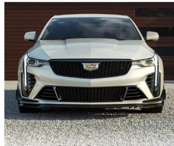
GRW – Rift Metallic 1