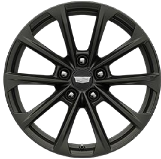
R37 – 18" alloy with Satin Graphite finish