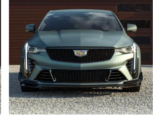
G7W – Dark Emerald Matte 2