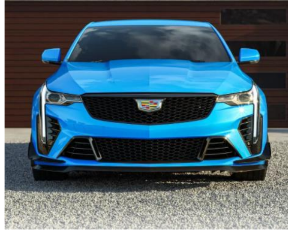
GMO – Electric Blue 1