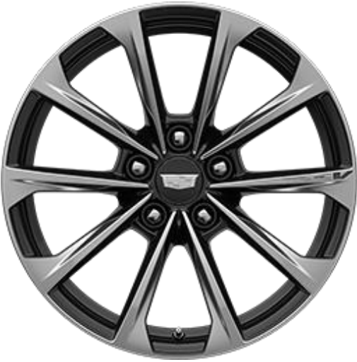
R38 – 18" alloy with Polished / Dark Android finish