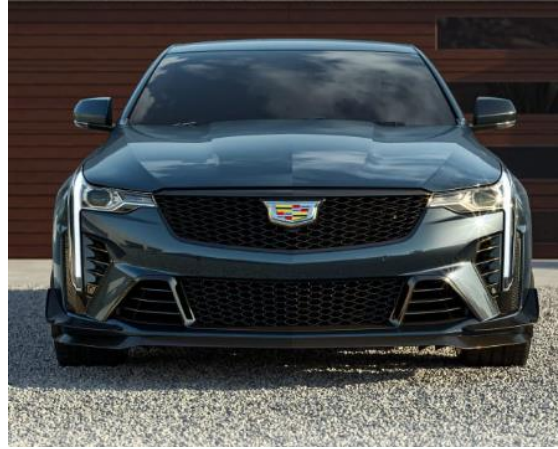
GJI – Shadow Metallic 1