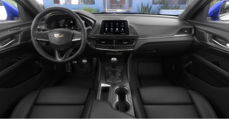
HZQ – Jet Black interior; performance front seats and steering wheel; and leatherette seating. High-performance steering wheel (BTH) available.